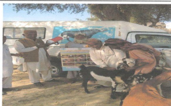
PPR Vaccination in District Tharparkar