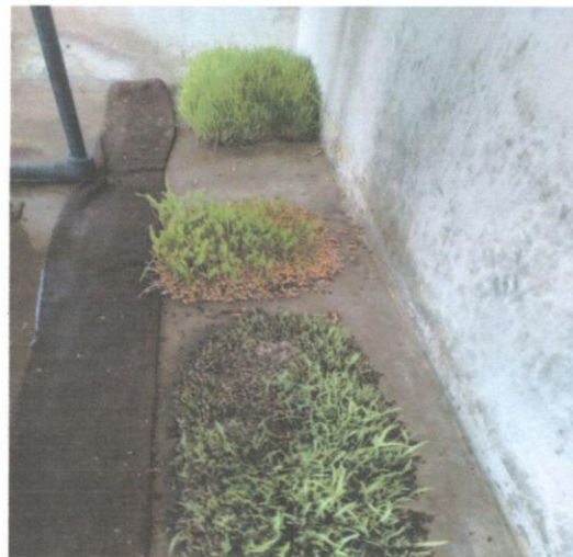
Hydroponic fodder demonstration in village BewatoTharparkar