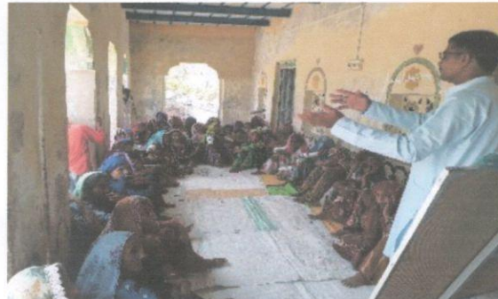
One day Awareness session on Livestock Management