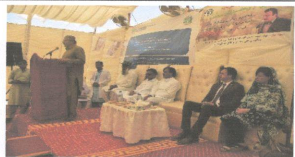
Inauguration of PPR Vaccination campaign in Tharparkar Sindh