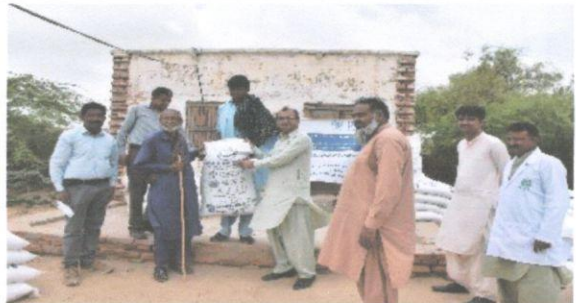
Distribution of Animal Compound Feed in District Tharparkar