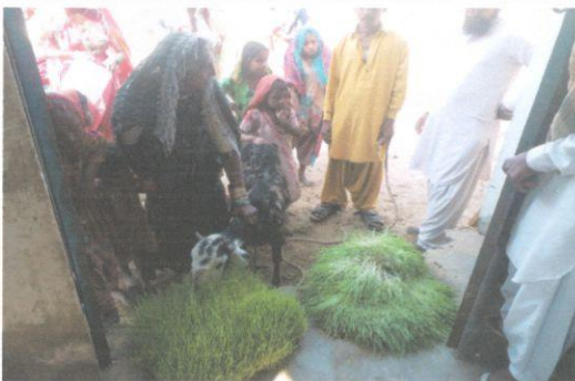
Hydroponic fodder demonstration in village Bewato Tharparkar