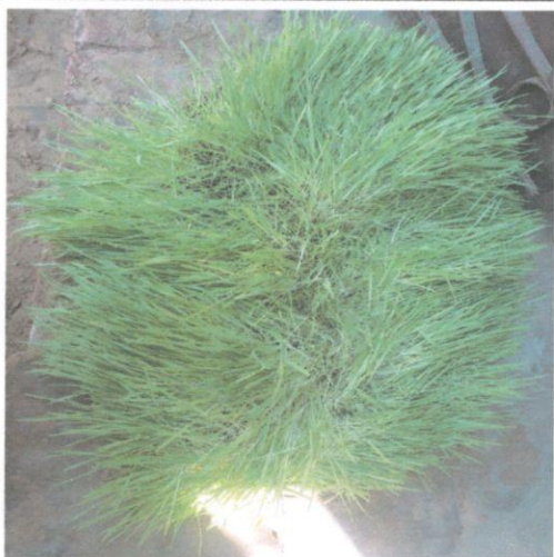
Hydroponic fodder demonstration in village BewatoTharparkar