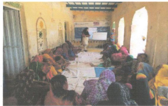
One day Awareness session on Livestock Management