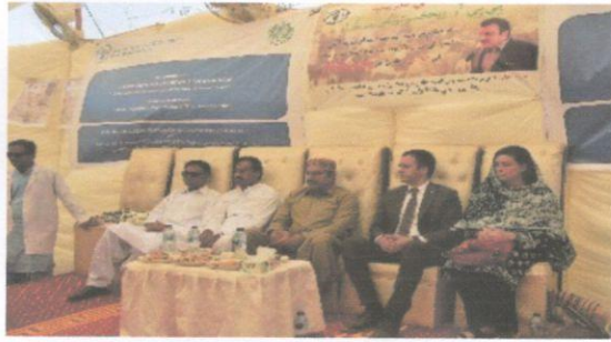
Inauguration of PPR Vaccination campaign in Tharparkar Sindh