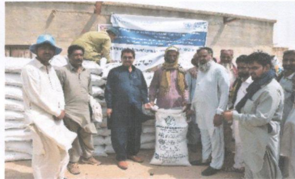
Distribution of Animal Compound Feed in District Tharparkar