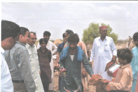
PPR Vaccination in District Tharparkar