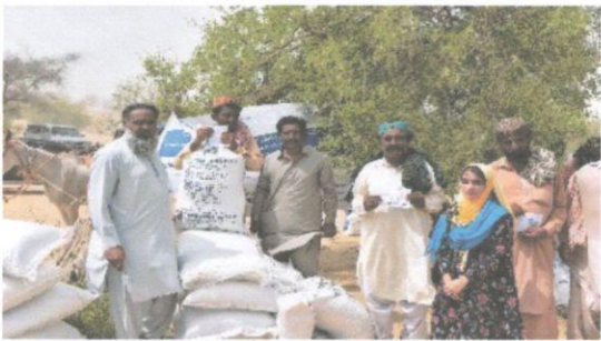
Distribution of Animal Compound Feed in District Tharparkar