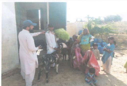
Hydroponic fodder demonstration in village BewatoTharparkar