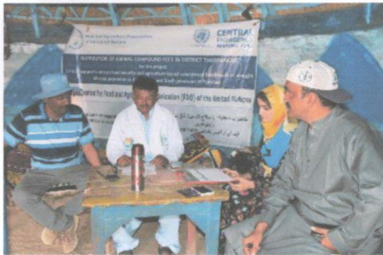
Distribution of Animal Compound Feed in District Tharparkar