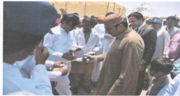
Inauguration of PPR Vaccination campaign in Tharparkar Sindh